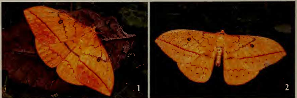
Figs. 1-2. Female (1) and male (2) of Sinobirma malaisei .